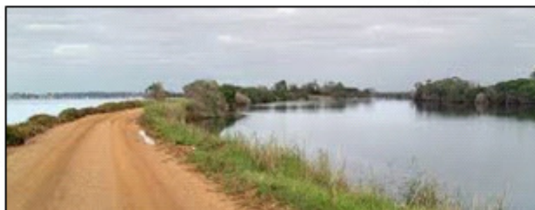
On the road to learning...

Courses held at: Paynesville- 55 The Esplanade Bairnsdale - Dalmahoy St