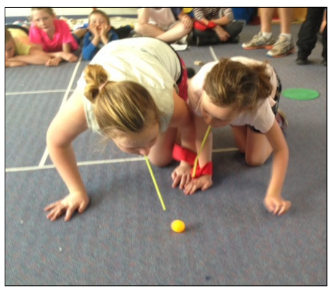
Students participated with their Mates in a series of activities last Friday morning.