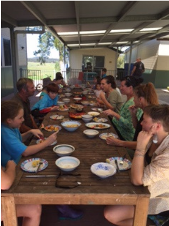
Enjoying our whole school lunch.