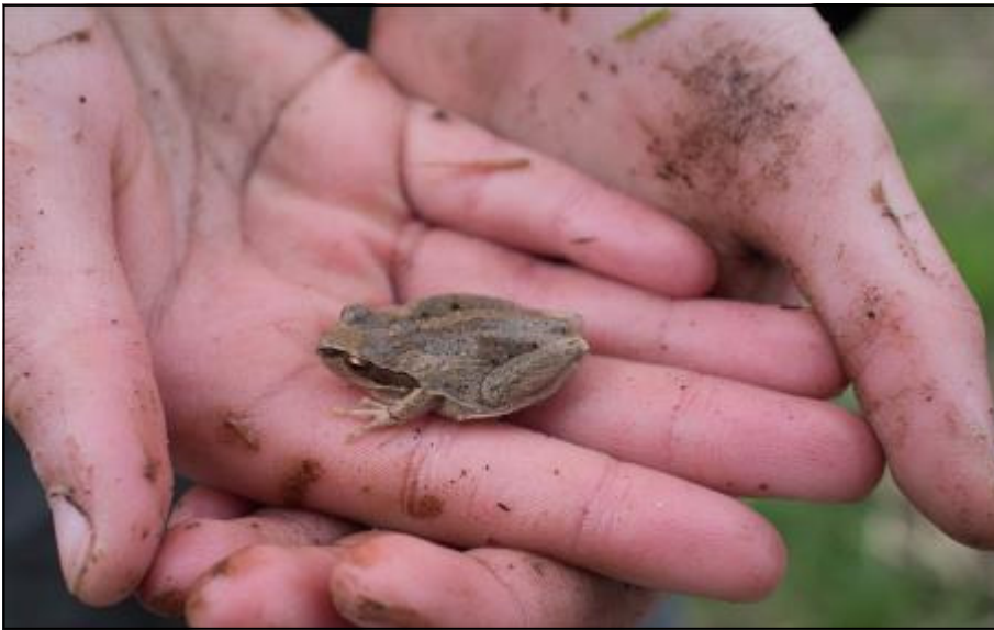
Ashley found a Southern Brown Tree Frog while weeding our garden.