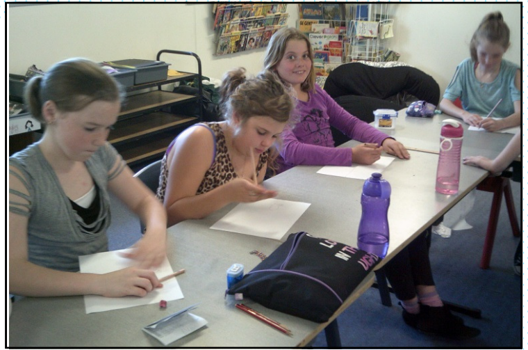
Students creating designs that represent family. These will be incorporated into our Koorie artwork.